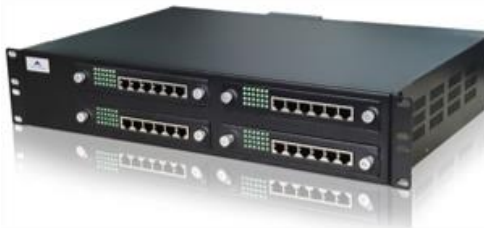
OM200 100~200 extensions

*The OM20/OM50 are enhanced models available in April 2015 with unique features such as Smart FoIP®.