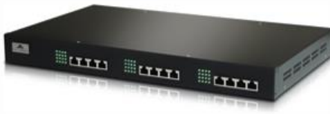
OM80 30~100 extensions